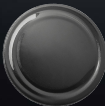
glass tray clear 7-NAM CL-6903-34M 340 mm