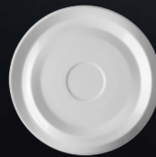
espresso saucer NAM 1717 180 mm