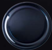
glass tray blue 7-NAM BL-6903-34M 340 mm