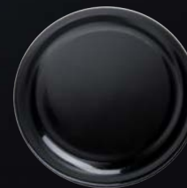
glass tray black 7-NAM BC-6903-34M 340 mm