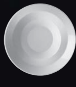
salad bowl NAM 1423