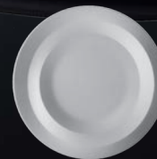
flat plate NAM 2127 275 mm