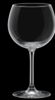
Burgundy 10 46cl 15½oz H 188mm 7½" D 100mm 3¾" No. 6200 1000