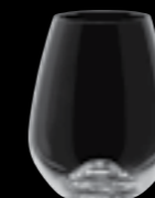
Wine 02 33 cl 11 ¼ oz H 100 mm 4" D 79 mm 3" No. 4245 0200