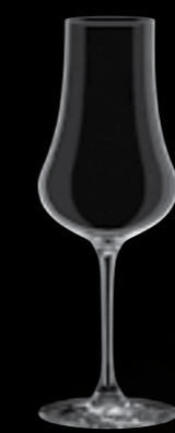
Fruit spirits glass 35 26cl 9oz H 210mm 8¼" D 77mm 3" No. 6751 3500