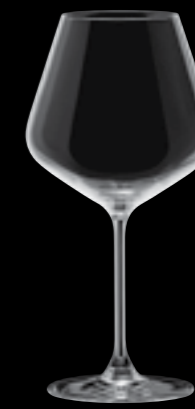
Burgundy 10 69 cl 23 ½ oz H 225 mm 8 ¾" D 114 mm 4 ½" No. 6605 1000