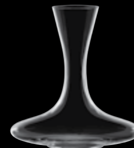
Carafe 74 100 cl 34 oz H 218 mm 8 5/8" D 208 mm 8 1/4" No. 2819 7400