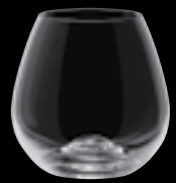
Burgundy 10 44 cl 15 oz H 95mm 3 ¾" D 95mm 3 ¾" No. 4245 1000