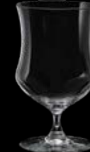
Stout 19 57 cl 19¼ oz H 162 mm 6¼" D 95 mm 3¾" No. 6717 1900

— Filling marks available as shown in the pricelist/on demand