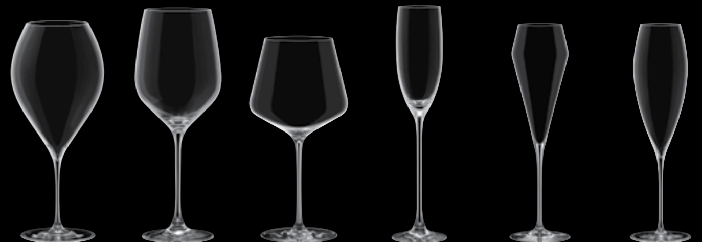
Wine 00 93 cl 31 1/2 oz H 252 mm 10" D 110 mm 4 1/2" No. 62417 0000 Bordeaux 00 67 cl 22 3/4 oz H 270 mm 10 3/4" D 103 mm 4" No. 6051 0000 Burgundy 10 73 cl 25 oz H 230 mm 9" D 118 mm 4 3/4" No. 6829 1000 Champagne flute 07 18 cl 6 oz H 275 mm 10 3/4" D 66 mm 2 1/2" No. 6051 0700 Champagne flute 09 22 cl 7 1/2 oz H 250 mm 10" D 70 mm 2 3/4" No. 6829 0900 Champagne 07 27 cl 9 oz H 250 mm 10" D 72 mm 2 3/4" No. 62417 0700