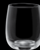
Cocktail tumbler 15 25 cl 8 ½ oz H 90 mm 3 ½" D 79 mm 3 ¼" No. 4233 1500