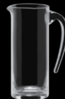
Pitcher 46 80 cl 27 oz H 205 mm 8 1/8" D 105 mm 4 1/8" No. 61534A4600