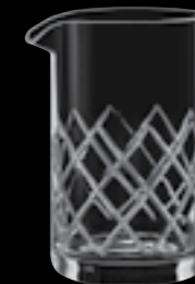
Beaker Diamond 73 60cl 20 1/4oz H 146mm 5 3/4" D 87mm 3 3/4" No. 5702 7310