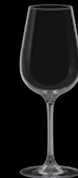
Wine 02 25 cl 8½ oz H 195 mm 7¾" D 73 mm 2¾" No. 6339 0200