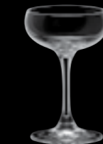
Cordial saucer 06 7,5cl 2½oz H 110mm 4½" D 71mm 2¾" No. 6200 A 0600

— Filling marks available as shown in the pricelist/on demand