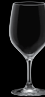
Wine 02 36 cl 12¼ oz H 185 mm 7¼" D 84 mm 3¼" No. 6087 0200