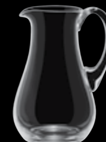
Pitcher 49 100 cl 33 3/4 oz H 196 mm 7 3/4" D 130 mm 5 1/8" No. 2818 4900