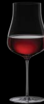
WINE GLASS FOR WELL- STRUCTURED WHITE AND ROSÉ WINES, BUT ALSO YOUNG RED WINES

110 cl 37 ¼ oz H 275 mm 10¾" D 116 mm 4½" No. 7287 0000