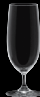
Pilsener 19 36 cl 12 1/4 oz H 184 mm 7 1/4" D 79 mm 3 1/4" No. 6006 1900