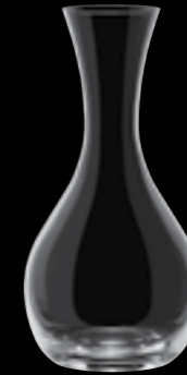
Carafe 74 120 cl 40 1/2 oz H 256 mm 10 1/8" D 130 mm 5 1/8" No. 5390 7400