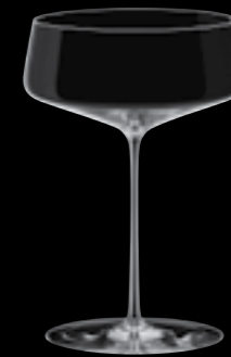
Champagne saucer 08 54cl 18¼oz H 180mm 7" D 123mm 4¾" No. 64900 A 0800