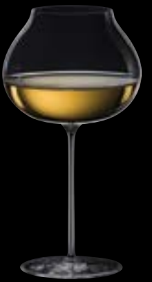
WINE GLASS FOR THE GREATEST WHITE WINES IN THE WORLD

90 cl 30 ½ oz H 232 mm 9¼" D 123 mm 4¾" No. 7287 3000