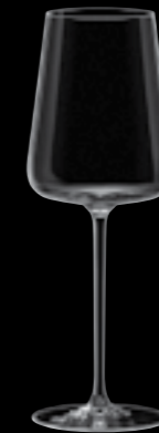
Wine 02 36 cl 12 1/4 oz H 220 mm 8 3/4" D 80 mm 3 1/4" No. 7048 0200