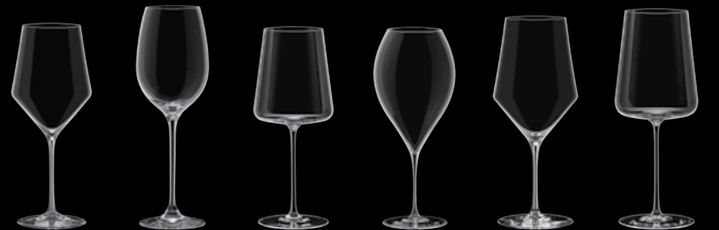
Wine 01 52 cl 17 3/4 oz H 230 mm 9" D 93 mm 3 3/4" No. 6829 0100 Wine 01 46 cl 15 1/2 oz H 255 mm 10" D 85 mm 3 1/2" No. 6051 0100 Wine 01 55 cl 18 1/2 oz H 230 mm 9" D 94 mm 3 3/4" No. 7048 0100 Wine 01 71 cl 24 oz H 230 mm 9" D 96 mm 4" No. 62417 0100 Bordeaux 00 64 cl 21 3/4 oz H 240 mm 9 1/2" D 100 mm 4" No. 6829 0000 Bordeaux 00 68 cl 23 oz H 250 mm 9 3/4" D 98 mm 3 3/4" No. 7048 0000