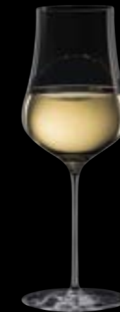
WINE GLASS FOR YOUNG ROSÉ AND WHITE WINES

46 cl 15 ½ oz H 241 mm 9½" D 100 mm 4" No. 7287 3400