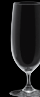
Pilsener 19 36cl 12¼oz H 184mm 7¼" D 79mm 3¼" No. 6006 1900