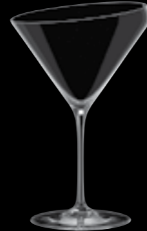
Martini 28 39cl 13½oz H 190mm 7½" D 124mm 4¾" No. 6829 R 2800