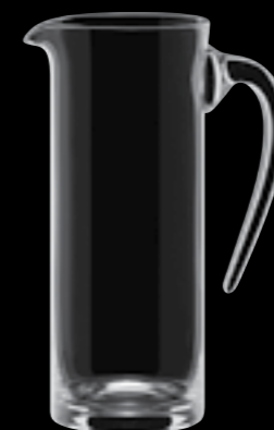
Pitcher 49 100 cl 33 3/4 oz H 255 mm 10" D 115 mm 4 1/2" No. 61534A4900