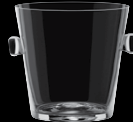
Champagne cooler 95 H 223mm 8¾" D 235mm 9¼" No. 2823 9500