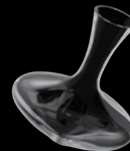
Carafe 75 150 cl 50 1/2 oz H 230 mm 9" D 206 mm 8 1/4" No. 60755 7500

— Filling marks available as shown in the pricelist/on demand