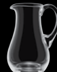
Pitcher 46 50 cl 17 oz H 155 mm 6 1/8" D 105 mm 4 1/8" No. 2818 4600