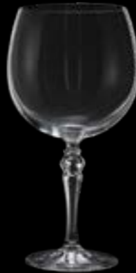
Gin Tonic 00 63cl 21¼oz H 203mm 8" D 105mm 4¼" No. 8303 0000