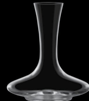
Carafe 75 150 cl 50 3/4 oz H 260 mm 10" D 228 mm 8 3/4" No. 5979 7500