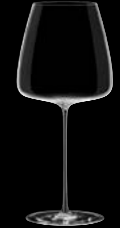
MEDEIA Bordeaux 00 89 cl 30 oz H 255 mm 10" D 115 mm 4 1/2" No. 64903 0000