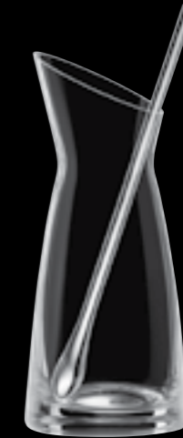
Mixer 84cl 28½oz H 241mm 9½" D 105mm 4¼" No. 5261A