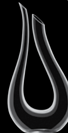
Orion H 326 mm 12 ¾" No. H 361

— Filling marks available as shown in the pricelist/on demand