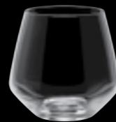
Old Fashioned 16 39cl 13oz H 90mm 3½" D 95mm 3¾" No. 4220 1600