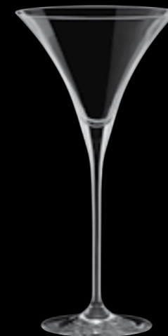
Martini 28 24 cl 8 oz H 275mm 10¾" D 127mm 5" No. 6051 2800