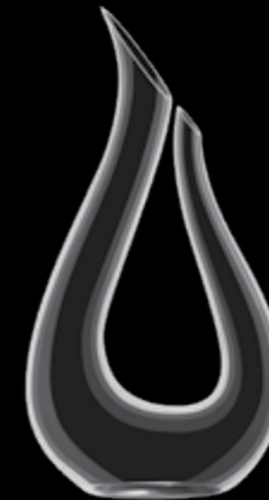
Columba H 365mm 14½" No. H 363