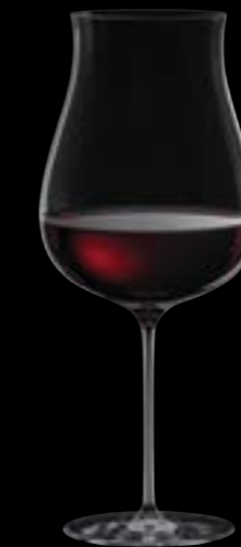
WINE GLASS FOR RED WINES MADE FROM MODERATELY- COLORING GRAPE VARIETIES

110 cl 37 ¼ oz H 275 mm 10¾" D 116 mm 4½" No. 7287 0000