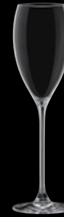
Champagne glass 09 26 cl 8 ¾ oz H 242 mm 9 ½" D 72 mm 2 ¾" No. 6605 0900