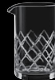
Beaker Cumberland 73 60cl 20 1/4oz H 146mm 5 3/4" D 87mm 3 3/4" No. 5702 7376