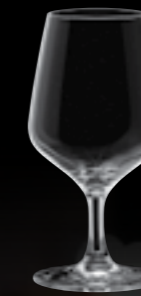
Mineral water 11 37 cl 12½ oz H 151 mm 6" D 86 mm 3½" No. 6275 1100