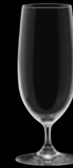
Pilsener 19 36cl 12¼oz H 184mm 7¼" D 79mm 3¼" No. 6006 1900