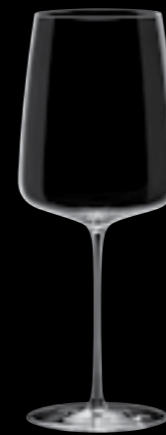
Wine 01 68cl 23oz H 245mm 9¾" D 95mm 3¾" No. 64900 A 0100