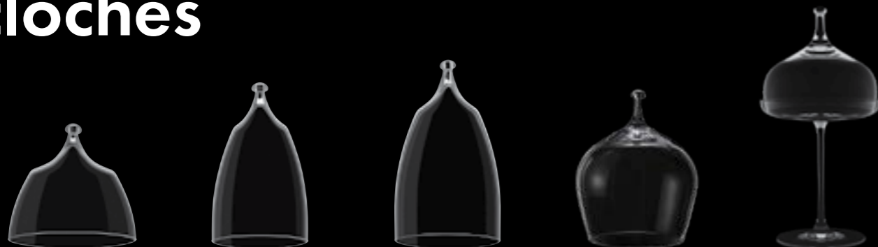
Cloche 105 H 104mm 4¼" D 110mm 4¼" No. 6719 0105 Cloche 150 H 150mm 6" D 83mm 3¼" No. 6719 0150 Cloche 160 H 160mm 6¼" D 91mm 3½" No. 6719 0160 Cloche 140 H 140mm 5½" D 116mm 4½" No. 6558 0140 Dome 012 H 139mm 5½" D 120mm 4¾" No. 7048 B 0012

While cloches were originally designed to protect seedlings from the cold and frost, they now bring the art of food presentation to a new level of sophistication and elegance. Each cloche, designed from the bowls of RONA wine glasses, boasts brilliance and clarity, while enticing diners with delectable morsels worthy of such a display. Paired with the perfect plate or tray on their own or in sets, RONA Cloches will create an unforgettable dining experience!