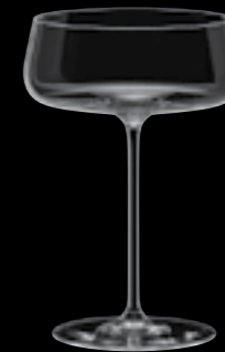
Champagne saucer 08 42,5 cl 14 1/4 oz H 170 mm 6 3/4" D 120 mm 4 3/4" No. 7048 0800