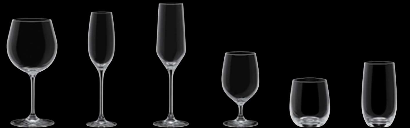
Burgundy 10 61 cl 20 ¾ oz H 213 mm 8 ½" D 105 mm 4" No. 6265 1000 Champagne flute 07 15 cl 5 oz H 230 mm 9" D 62 mm 2 ½" No. 6050 0700 Champagne flute 07 22 cl 7 ½ oz H 250 mm 10" D 74 mm 3" No. 6103 0700 Mineral water 11 31 cl 10 ½ oz H 150 mm 6" D 78 mm 3" No. 6050 1100 Old fashioned 16 36 cl 12 ¼ oz H 95 mm 3 ¾" D 84 mm 3 ¾" No. 4233 1600 Beer tumbler 13 35 cl 11 ¾ oz H 132 mm 5 ¼" D 73 mm 2 ¾" No. 4233 1300