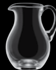
Pitcher 46 50 cl 17 oz H 145 mm 5 3/4" D 102 mm 4" No. 2805 4600