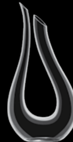
Orion H 326mm 12¾" No. H 361