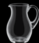
Pitcher 43 20 cl 6 3/4 oz H 108 mm 4 1/4" D 77 mm 3" No. 2805 4300