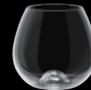
Doub. Old fashioned 166 54 cl 18 ¼ oz H 97mm 3 ¾" D 102mm 4" No. 4245 1660