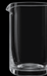
Beaker 73 60cl 20 1/4oz H 146mm 5 3/4" D 87mm 3 3/4" No. 5702 7300