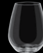
Water 15 33 cl 11 ¼ oz H 100mm 4" D 79mm 3" No. 4485 1500