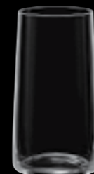
Hi Ball 122 43 cl 14 1/2 oz H 135 mm 5 1/4" D 74 mm 3" No. 7048 1220