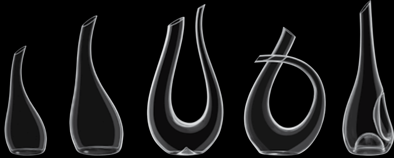
Dorado H 290mm 11½" No. H 330 Delfinus H 370mm 14½" No. H 330 Centaurus H 400mm 15¾" No. H 336 Pegasus H 340mm 13½" No. H 337 Gyrus H 410mm 16¼" No. H 353

Uniquely shaped and fully hand crafted, RONA offers a wide range of these free formed carafes specially designed for exclusive occasions. Each of these unusual shapes is designed to develop any wine to its peak potential.