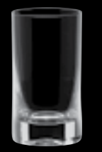
Water tumbler 19 19cl 6 ½ oz H 108mm 4 ¼" D 58mm 2 ¼" No. 4232 1900