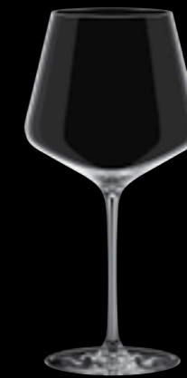
Burgundy 10 73cl 25oz H 230mm 9" D 118mm 4¾" No. 6829 1000