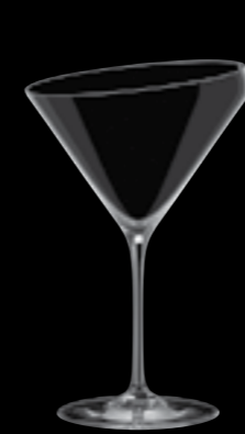
Martini 28 39cl 13½oz H 190mm 7½" D 124mm 4¾" No. 6829 R 2800