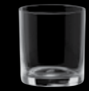
Old fashioned 16 28cl 9 ½ oz H 88mm 3 ½" D 80mm 3 ¼" No. 4232 1600