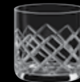
OF Diamond 16180 37cl 12 1/2oz H 85mm 3 1/4" D 85mm 3 1/4" No. 8077 H / 16180