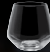
Old Fashioned 16 39 cl 13¼ oz H 90 mm 3½" D 95 mm 3¾" No. 4220 1600