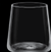
DOF 166 41 cl 13 3/4 oz H 90 mm 3 1/2" D 90 mm 3 1/2" No. 7048 1660