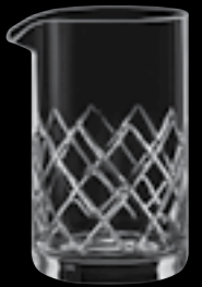
Beaker Cumberland 73 60cl 20¼oz H 146mm 5¾" D 87mm 3¾" No. 5702 7376