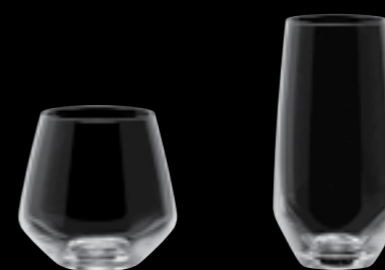
Old Fashioned 16 39 cl 13 ¼ oz H 90 mm 3 ½" D 95 mm 3 ¾" No. 4220 1600 Highball 12 46 cl 15 ½ oz H 145 mm 5 ¾" D 76 mm 3" No. 4220 1200

— Filling marks available as shown in the pricelist/on demand