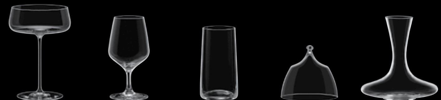
Champagne saucer 08 42,5 cl 14 1/4 oz H 170 mm 6 3/4" D 120 mm 4 3/4" No. 7048 0800 Mineral water 11 37 cl 12 1/2 oz H 151 mm 6" D 86 mm 3 1/2" No. 6275 1100 Hi Ball 122 43 cl 14 1/2 oz H 135 mm 5 1/4" D 74 mm 3" No. 7048 1220 Cloche 105 H 104 mm 4 1/8" D 110 mm 4 1/4" No. 6719 0105 Carafe 70 35 cl 11 3/4 oz H 150 mm 6" D 144 mm 5 1/2" No. 2819 7000

— Filling marks available as shown in the pricelist/on demand