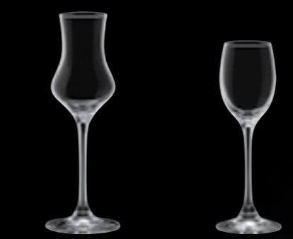
Grappa 35 9 cl 3 oz H 182 mm 7¼" D 64 mm 2½" No. 6050 3500 Cordial 05 7 cl 2¼ oz H 158 mm 6¼" D 56 mm 2¼" No. 6001 0500

— Filling marks available as shown in the pricelist/on demand.