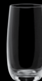
Highball 12 49 cl 16 ½ oz H 144 mm 5 ½" D 79 mm 3" No. 4233 1200

— Filling marks available as shown in the pricelist/on demand