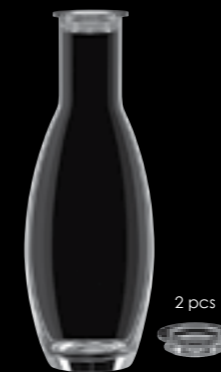
Carafe Lahiti 73 127 cl 43 oz H 280 mm 11" D 104 mm 4" No. 5729 7300