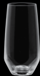
Highball 12 46cl 15½oz H 145mm 5¾" D 76mm 3" No. 4220 1200