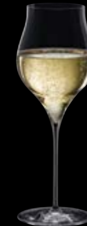
WINE GLASS FOR SPARKLING WINES

52 cl 17 ½ oz H 246 mm 9¾" D 92 mm 3¾" No. 7287 3300