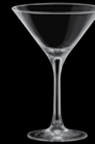
Martini 28* 18cl 6oz H 158mm 6¼" D 111mm 4½" No. 6200 2800