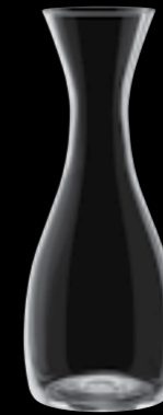
Carafe 74 100 cl 34 oz H 287 mm 11 1/4" D 112 mm 4 3/8" No. 2821 7400