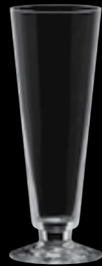
Beer tumbler 19 38cl 12¾oz H 203mm 8" D 75mm 3" No. 7238 1900