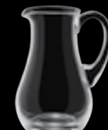
Pitcher 44 25 cl 8 1/2 oz H 124 mm 4 7/8" D 82 mm 3 1/4" No. 2818 4400