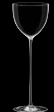
NEREA Cordial 05 13 cl 4 1/2 oz H 210 mm 8 1/4" D 72 mm 2 3/4" No. 64954 0500