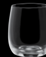
Doub. Old fashioned 166 46 cl 15 ½ oz H 103 mm 4" D 90 mm 3 ½" No. 4233 1660