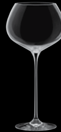
Burgundy 36 73 cl 24¾ oz H 260mm 10¼" D 124mm 5" No. 6051 3600