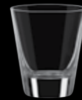
Old fashioned 16 29 cl 9¾ oz H 98 mm 3¾" D 90 mm 3½" No. 4836 1600