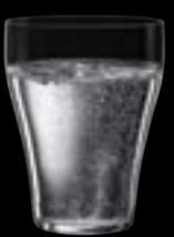
GLASS FOR SPARKLING WATER

50 cl 17 oz H 113 mm 4½" D 91 mm 3½" No. 7287 3120