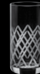
HB Diamond 12180 39cl 13 1/4oz H 135mm 5 1/4" D 70mm 2 3/4" No. 8077 H / 12180