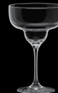
Margarita 32 34cl 11½oz H 172mm 6¾" D 111mm 4½" No. 6006 3200