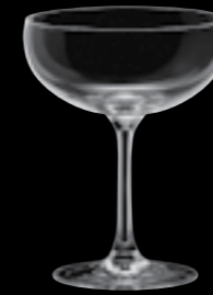
Champagne saucer 08 28cl 9½oz H 144mm 5¾" D 114mm 4½" No. 6200 0800