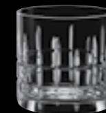
OF Montgomery 16925 37cl 12 1/2oz H 85mm 3 1/4" D 85mm 3 1/4" No. 8077 H / 16925