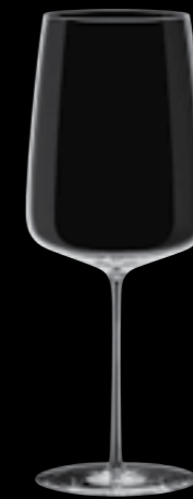
Bordeaux 00 86cl 29oz H 260mm 10¼" D 100mm 4" No. 64900 A 0000