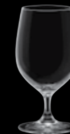
Mineral water 11 31cl 10½oz H 150mm 6" D 78mm 3" No. 6050 1100