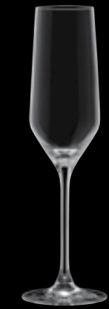
Champagne flute 07 22 cl 7½ oz H 250 mm 10" D 74 mm 3" No. 6103 0700