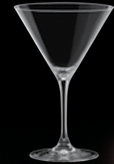
Martini 28 30 cl 10¼ oz H 188 mm 7½" D 125 mm 4½" No. 6103 2800