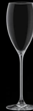
Champagne glass 09

69 cl 23¼ oz H 225 mm 8¾" D 114 mm 4½" No. 6605 1000