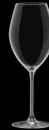
Syrah / Pinot noir 01

48 cl 16¼ oz H 230 mm 9" D 91 mm 3½" No. 6605 0200