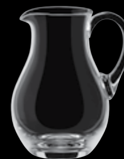
Pitcher 51 150 cl 50 3/4 oz H 208 mm 8 1/4" D 147 mm 5 3/4" No. 2805 5100