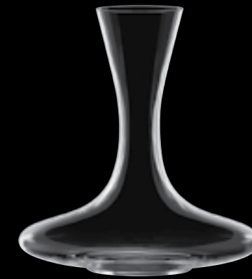
Carafe 74 100 cl 34 oz H 218 mm 8 ⅝" D 208 mm 8 ¼" No. 2819 7400