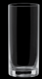
Beer tumbler 13 30cl 10 ¼ oz H 145mm 5 ¾" D 64mm 2 ½" No. 4232 1300