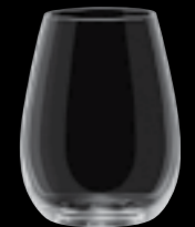
Mix Drink 122 47 cl 16 oz H 112mm 4 ½" D 87mm 3 ½" No. 4485 1220