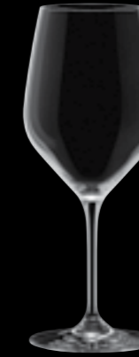
Wine 01 * 55 cl 18½ oz H 228 mm 9" D 93 mm 3¾" No. 6263 0100