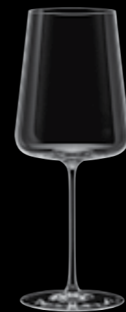
Bordeaux 00 68 cl 23 oz H 250 mm 9 3/4" D 98 mm 3 3/4" No. 7048 0000