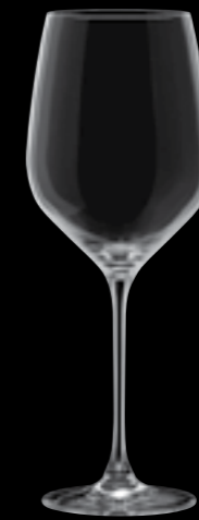
Bordeaux 00 67 cl 22¾ oz H 270mm 10¾" D 103mm 4" No. 6051 0000