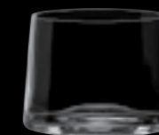
Mineral water 19 48cl 16¼oz H 75mm 3" D 102mm 4" No. 64955 1900