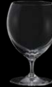
Ale beer 19 60 cl 20¼ oz H 158 mm 6¼" D 102 mm 3¾" No. 6716 1900