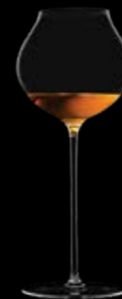
WINE GLASS FOR ORANGE WINE

76 cl 25 ¾ oz H 224 mm 8¾" D 120 mm 4¾" No. 7287 3200