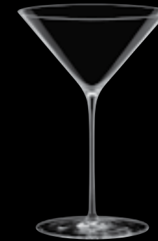
Martini 28 34cl 11½oz H 190mm 7½" D 130mm 5" No. 64900 A 2800