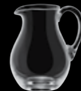
Pitcher 44 25 cl 8 1/2 oz H 115 mm 4 1/2" D 82 mm 3 1/4" No. 2805 4400