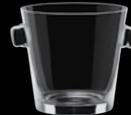
Ice bucket 91 H 130mm 5¼" D 138mm 5½" No. 2823 9100