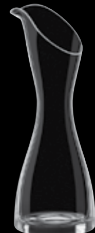
Carafe Jabiru 120cl 40½oz H 300mm 11¾" D 120mm 4¾" No. 64545 B 7400

⇒ Filling marks available as shown in the pricelist/on demand