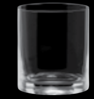
Doub. Old fashioned 166 39cl 13 ¼ oz H 102mm 3 ¾" D 88mm 3 ½" No. 4232 1660