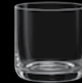
OF 16 37cl 12 1/2oz H 85mm 3 1/4" D 85mm 3 1/4" No. 8077 H / 1600