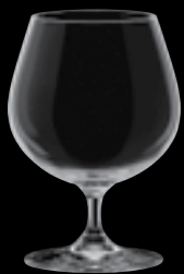
Brandy 18 40cl 13½oz H 138mm 5½" D 95mm 3¾" No. 6201 1800