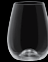
Bordeaux 00 46 cl 15 ½ oz H 112mm 4 ½" D 87mm 3 ½" No. 4245 0000