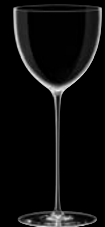
NEREA Wine 01 45 cl 15 1/4 oz H 240 mm 9 1/2" D 100 mm 4" No. 64954 0100