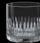
OF Whitley 16134 37cl 12 1/2oz H 85mm 3 1/4" D 85mm 3 1/4" No. 8077 H / 16134

— Filling marks available as shown in the pricelist/on demand