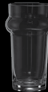
Pint glass 19 63 cl 21¼ oz H 162 mm 6¼" D 90 mm 3½" No. 4822 1900