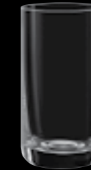
HB 12 39cl 13 1/4oz H 135mm 5 1/4" D 70mm 2 3/4" No. 8077 H / 1200