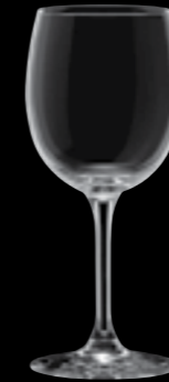
Wine 01 35 cl 11¼ oz H 195 mm 7½" D 85 mm 3½" No. 6200 0100