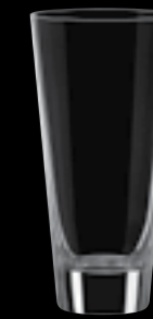
Long drink 12 39 cl 13¼ oz H 160 mm 6¼" D 80 mm 3¼" No. 4836 1200