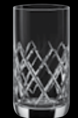
HB Knox 12076 39cl 13 1/4oz H 135mm 5 1/4" D 70mm 2 3/4" No. 8077 H / 12076