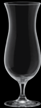
Longdrink "Hurricane" 33 46.5cl 15¾oz H 208mm 8¼" D 78mm 3" No. 6050 3300