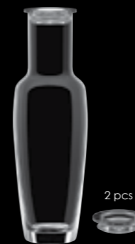
Carafe Pollis 73 87 cl 29 1/2 oz H 260 mm 10 1/4" D 86 mm 3 1/2" No. 5728 7300