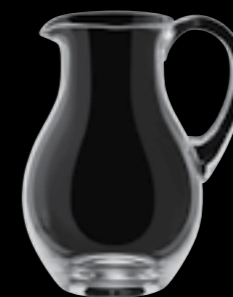
Pitcher 49 100 cl 33 3/4 oz H 196 mm 7 3/4" D 140 mm 5 1/2" No. 2805 4900