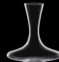
Carafe 70 35 cl 12 oz H 150 mm 6" D 144 mm 5 1/2" No. 2819 7000