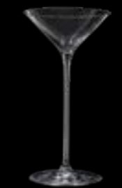
NEREA Liqueur martini 288 4 cl 1 1/4 oz H 140 mm 5 1/4" D 75 mm 3" No. 65320 A 2880

— Filling marks available as shown in the pricelist/on demand