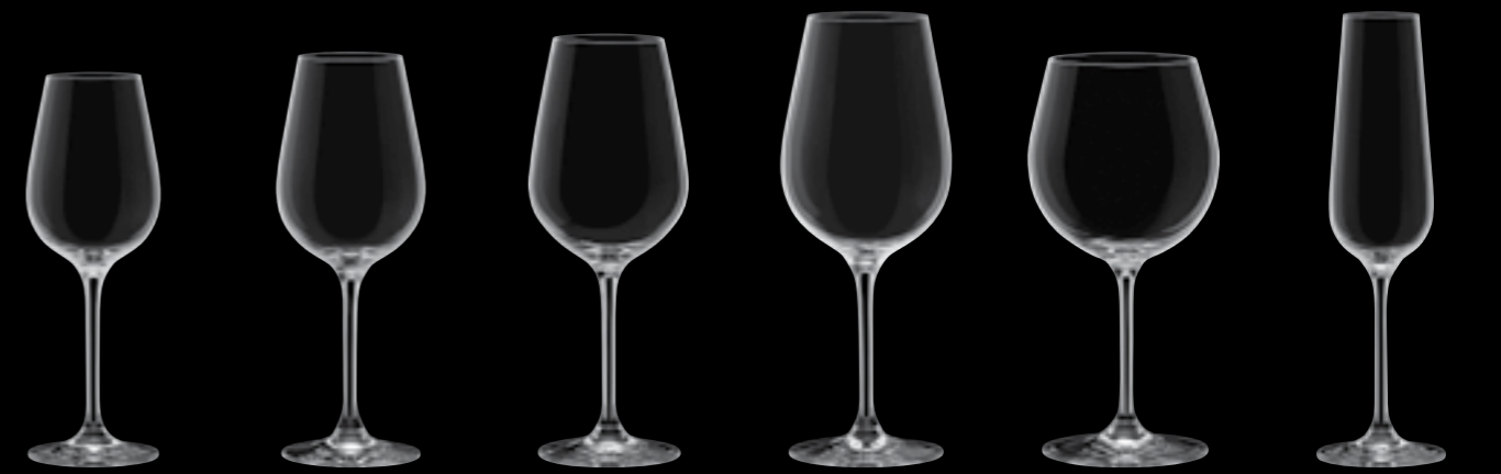
Wine 03 25 cl 8½ oz H 208 mm 8¼" D 73 mm 2¾" No. 6265 0300 Wine 02 35 cl 12 oz H 218 mm 8½" D 81 mm 3¼" No. 6265 0200 Wine 01 44 cl 15 oz H 228 mm 9" D 87 mm 3½" No. 6265 0100 Bordeaux 00 54 cl 18½ oz H 238 mm 9¼" D 93 mm 3½" No. 6265 0000 Burgundy 10 61 cl 20¾ oz H 213 mm 8½" D 105 mm 4" No. 6265 1000 Champagne flute 07 18 cl 6 oz H 238 mm 9½" D 70 mm 2½" No. 6265 0700