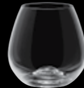
Burgundy 10 44cl 15oz H 95mm 3¾" D 95mm 3¾" No. 4245 1000