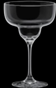
Margarita 32 34cl 11½oz H 172mm 6¾" D 111mm 4½" No. 6006 3200