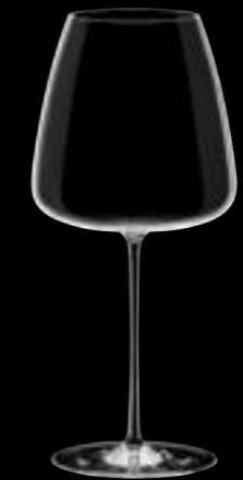
MEDEIA Wine 01 76 cl 25 3/4 oz H 240 mm 9 1/2" D 110 mm 4 1/4" No. 64903 0100