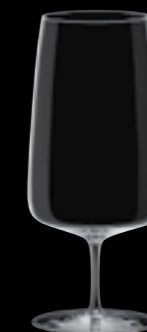
Pilsener 19 49cl 16½oz H 185mm 7¼" D 80mm 3" No. 64900 A 1900

— Filling marks available as shown in the pricelist/on demand