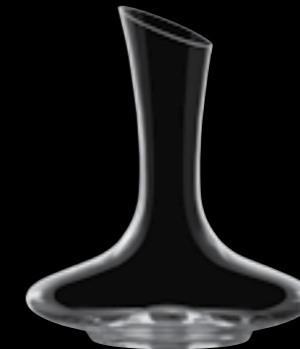
Carafe 75A 150 cl 50 3/4 oz H 260 mm 10" D 228 mm 8 3/4" No. 5979 A 7500