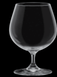
Brandy 18 40cl 13½oz H 138mm 5½" D 95mm 3¾" No. 6201 1800