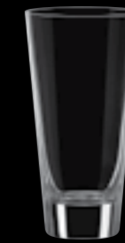
Highball 122 36 cl 12¼ oz H 151 mm 6" D 78 mm 3" No. 4836 1220