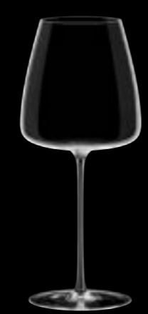
MEDEIA Wine 02 54 cl 18 1/4 oz H 225 mm 8 3/4" D 98 mm 3 3/4" No. 64903 0200