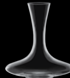
Carafe 73 75 cl 25 1/2 oz H 198 mm 7 3/4" D 187 mm 7 1/4" No. 2819 7300