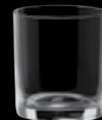
Old fashioned 16 28 cl 9½ oz H 88 mm 3½" D 80 mm 3¼" No. 4232 1600