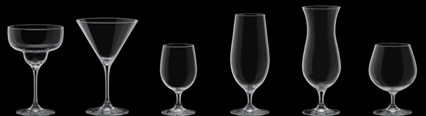
Margarita 32 34 cl 11½ oz H 172 mm 6¾" D 111 mm 4½" No. 6006 3200 Martini 28 30 cl 10¼ oz H 188 mm 7½" D 125 mm 4½" No. 6103 2800 Mineral water 11 24 cl 8 oz H 139 mm 5½" D 73 mm 2¾" No. 6200 1100 Pilsener 19 46 cl 15½ oz H 196 mm 8" D 78 mm 3" No. 6001 1900 Longdrink "Hurricane" 33 46,5 cl 15¾ oz H 208 mm 8¼" D 78 mm 3" No. 6050 3300 Brandy 18 40 cl 13½ oz H 138 mm 5½" D 95 mm 3¾" No. 6201 1800