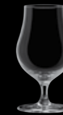
Single malt whiskey/whisky 20 cl 6 ¾ oz H 122 mm 4 ¾" D 69 mm 2 ¾" No. 6697 3200