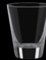
Double old fashioned 166 33 cl 11¼ oz H 105 mm 4¼" D 92 mm 3½" No. 4836 1660