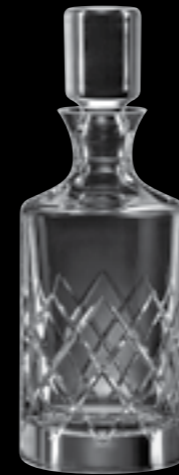
Whisky carafe 73 75cl 25 1/4oz H 273mm 10 3/4" D 100mm 4" No. 63659 F 7376