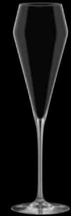
Champagne flute 09 22cl 7½oz H 250mm 10" D 70mm 2¾" No. 6829 0900