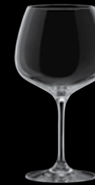
Burgundy 10* 68cl 23oz H 210mm 8¼" D 114mm 4½" No. 6050 1000