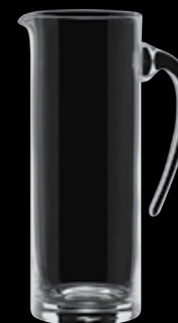
Pitcher 51 200 cl 67 3/4 oz H 300 mm 11 3/4" D 135 mm 5 1/2" No. 61534A5100

— Filling marks available as shown in the pricelist/on demand