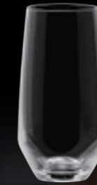
Highball 12 46 cl 15½ oz H 145 mm 5¾" D 76 mm 3" No. 4220 1200