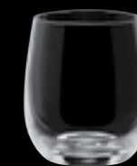
Old fashioned 16 36 cl 12 ¼ oz H 95 mm 3 ¾" D 84 mm 3 ¼" No. 4233 1600