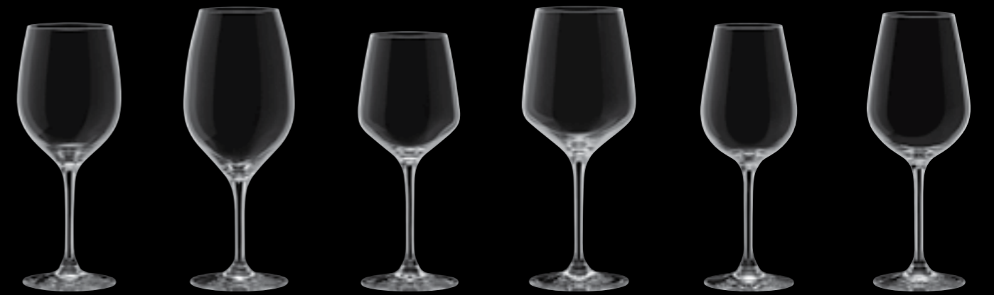
Wine 01 45 cl 15 ¼ oz H 220 mm 8 ¾" D 88 mm 3 ½" No. 6050 0100 Bordeaux 00 59 cl 20 oz H 230 mm 9" D 94 mm 3 ¾" No. 6050 0000 Wine 02 36 cl 12 ¼ oz H 210 mm 8" D 86 mm 3 ½" No. 6103 0200 Wine 01 51 cl 17 ¼ oz H 230 mm 9" D 96 mm 4" No. 6103 0100 Wine 02 35 cl 12 oz H 218 mm 8 ½" D 81 mm 3 ¾" No. 6265 0200 Wine 01 44 cl 15 oz H 228 mm 9" D 87 mm 3 ½" No. 6265 0100