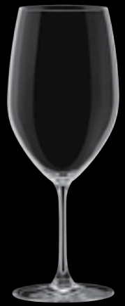
Grand reserva 36

60 cl 20¼ oz H 245 mm 9¾" D 92 mm 3½" No. 6605 0000