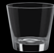
Cocktail 15 40 cl 13½ oz H 93 mm 3¾" D 104 mm 4" No. 4836 1500