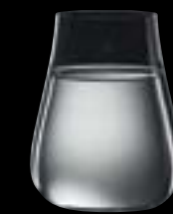
GLASS FOR STILL WATER

50 cl 17 oz H 247 mm 9¾" D 92 mm 3¾" No. 7287 3900