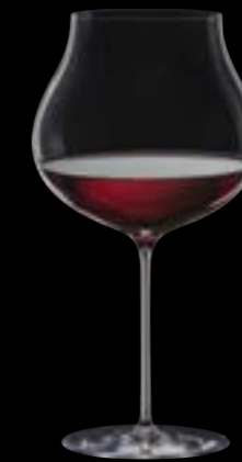
WINE GLASS FOR RED WINES MADE FROM TEINTURIER AND RED-FLESHED GRAPES

69 cl 23 ¼ oz H 243 mm 9½" D 102 mm 4" No. 7287 3100