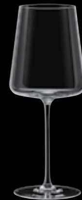
Wine 01 55 cl 18 1/2 oz H 230 mm 9" D 94 mm 3 3/4" No. 7048 0100