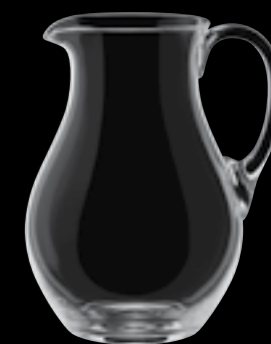
Pitcher 53 200 cl 67 3/4 oz H 228 mm 9" D 165 mm 6 1/2" No. 2805 5300