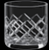
OF Knox 16076 37cl 12 1/2oz H 85mm 3 1/4" D 85mm 3 1/4" No. 8077 H / 16076