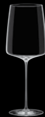
Wine 02 48cl 16¼oz H 230mm 9" D 86mm 3½" No. 64900 A 0200