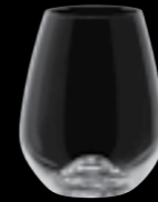
Wine 02 33 cl 11 ¼ oz H 100mm 4" D 79mm 3" No. 4245 0200