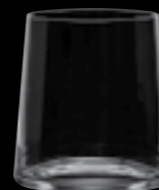
Old Fashioned 16 54cl 18¼oz H 100mm 4" D 95mm 3¾" No. 64955 1600