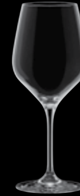
Wine 02 * 45 cl 15¼ oz H 215 mm 8½" D 89 mm 3½" No. 6263 0200