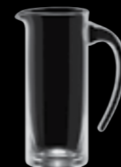
Pitcher 44 35 cl 11 3/4 oz H 150 mm 6" D 90 mm 3 1/2" No. 61534A4400