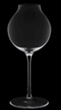
LIQUORE & COCKTAILS 25 cl 8 1/2 oz H 180 mm 7" D 38 mm 1 1/2" No. 65223 1010