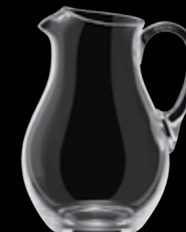
Pitcher with icelip 66 150 cl 50 3/4 oz H 215 mm 8 1/2" D 147 mm 5 3/4" No. 2825 6600